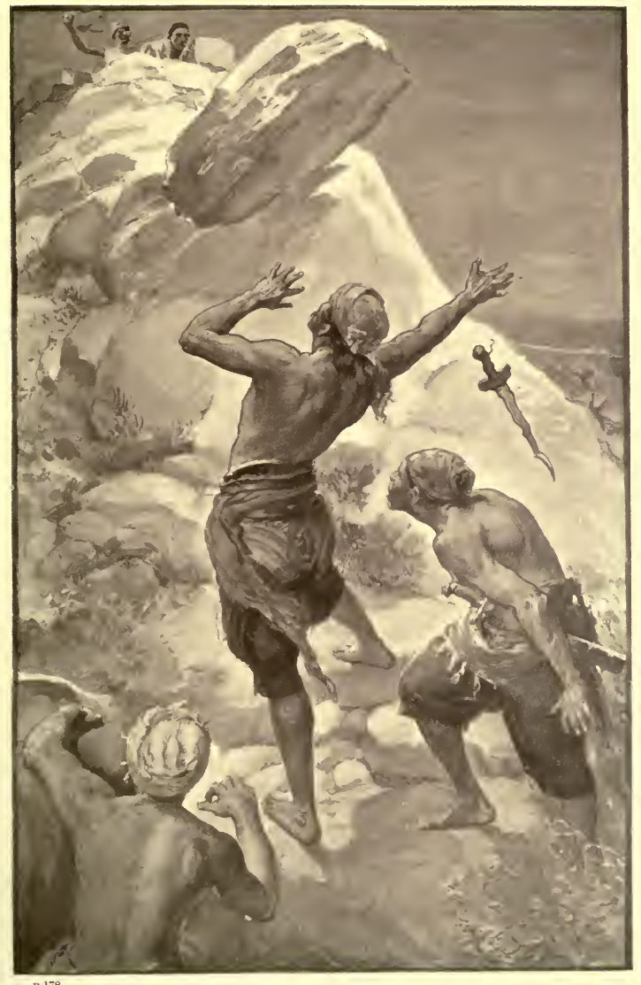
"HE LAUNCHED THE MISSILE AT THEM"